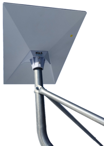
(Assembled with FB607042A)