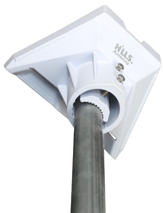
(Assembled with Small Pole)