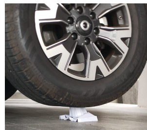
(Compression Load Test)